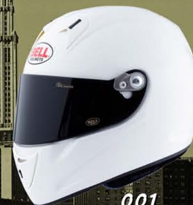
001 SOLID WHITE