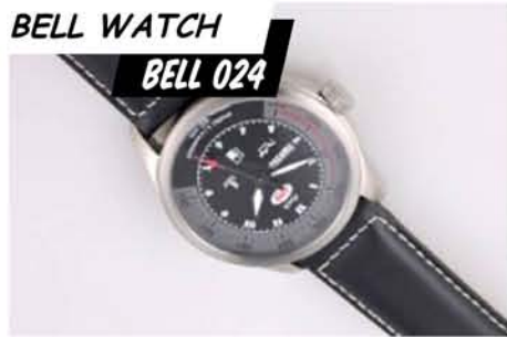
BELL 024 BELL WATCH