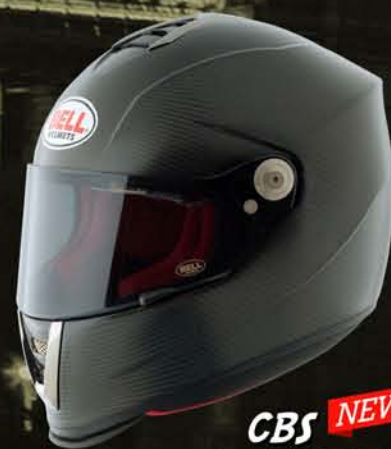
CBS NEW SOFT CARBON