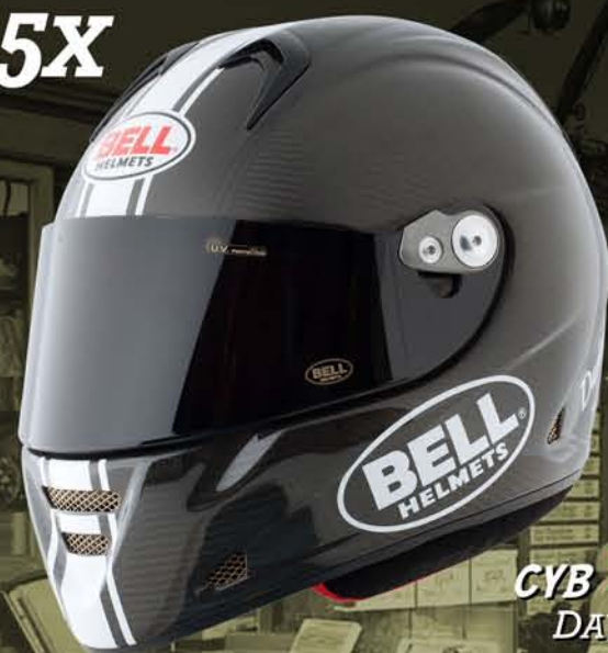
CYB NEW DAYTONA