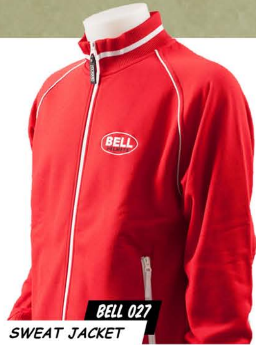
BELL 027 SWEAT JACKET