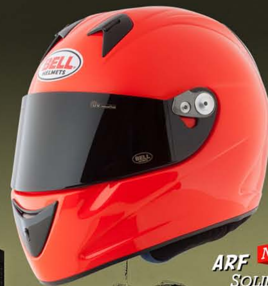
ARF NEW SOLID ORANGE