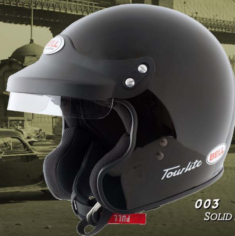
003 SOLID BLACK

SHELL ADVANCED COMPOSITE FIBRES INTERIOR REMOVABLE WASHABLE INTERIOR • DOUBLE D-RING SYSTEM