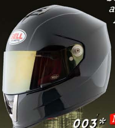
003* NEW SOLID BLACK

*SOLID COLORS additional visor & bag not included