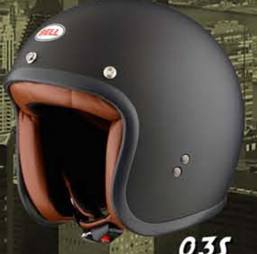
035 MATT BLACK