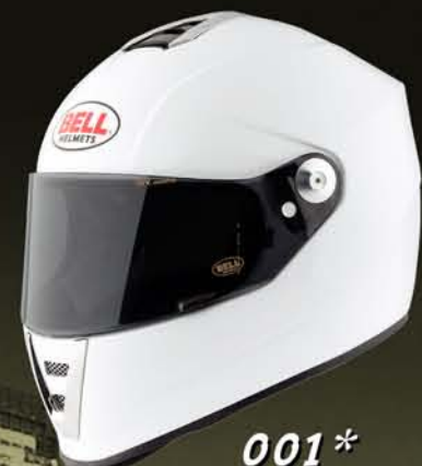
001* SOLID WHITE