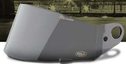
2 Visors Included ** ** excepting UK

SHELL PURE CARBON FIBRES 2 SHELLS VISOR PROFESSIONAL 3.2MM VISOR NoFOG/NoDROP+SMOKE 30 ADDITIONAL VISOR INTERIOR REMOVABLE WASHABLE INTERIOR • DOUBLE D-RING SYSTEM