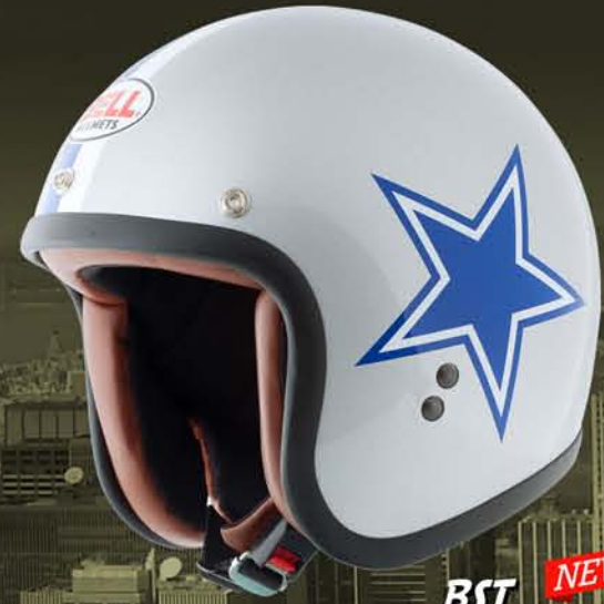
BST RT NEW