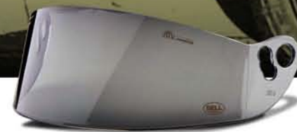
2 Visors Included * * excepting UK

SHELL MULTIAXIAL CARBON ARAMIDIC FIBRES 2 SHELLS VISOR PROFESSIONAL 3,2MM VISOR NoFOG/NoDROP+SMOKE 30 ADDITIONAL VISOR INTERIOR REMOVABLE WASHABLE INTERIOR • DOUBLE D-RING SYSTEM