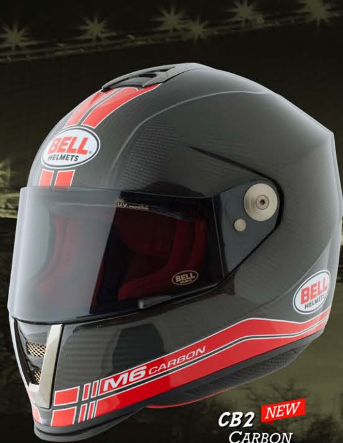
CB2 NEW CARBON