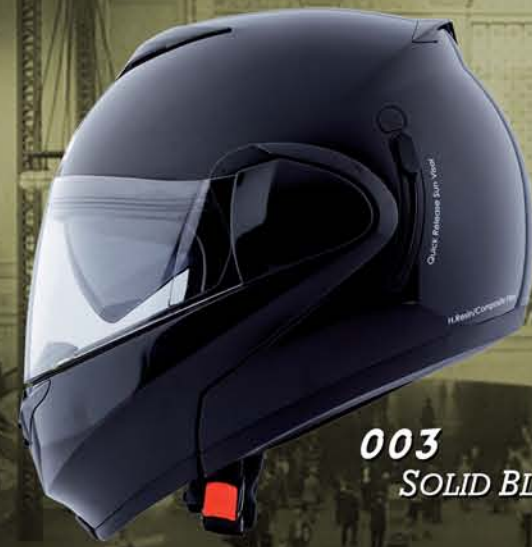
003 SOLID BLACK