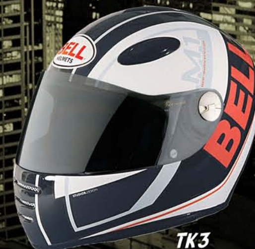
TK3 TRACKER BLACK

SHELL COMPOSITE MULTIFIBRES SHELLS VISOR 3,2MM VISOR ANTISRATCH NoFOG/NoDROP INTERIOR REMOVABLE WASHABLE INTERIOR • DOUBLE D-RING SYSTEM