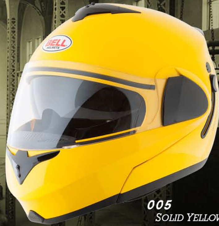
005 SOLID YELLOW