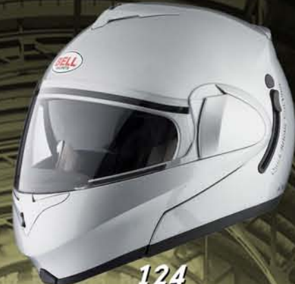
124 SOLID SILVER