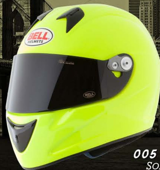
005 NEW SOLID YELLOW