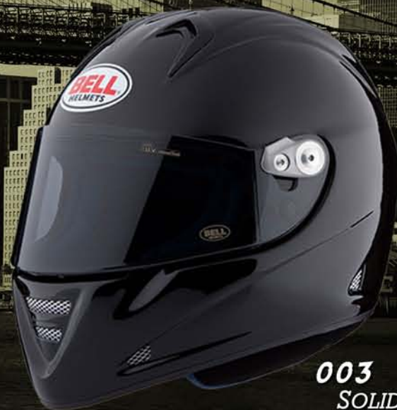
003 SOLID BLACK