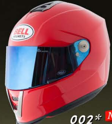
002* NEW SOLID RED