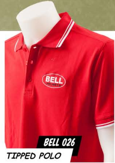
BELL 026 TIPPED POLO