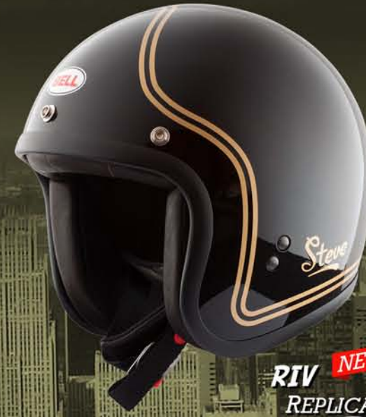
RIV RT NEW