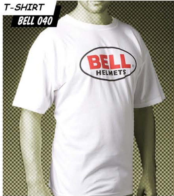
BELL 040 T-SHIRT