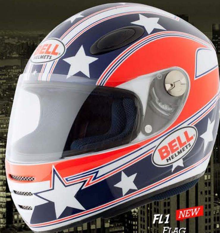
FL1 NEW FLAG