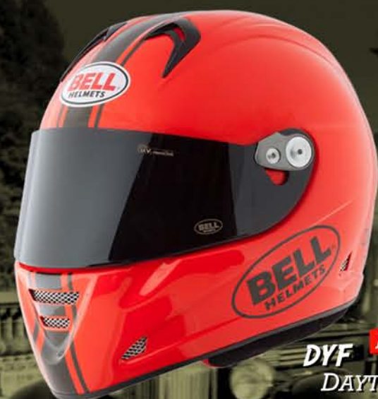
DYF NEW DAYTONA