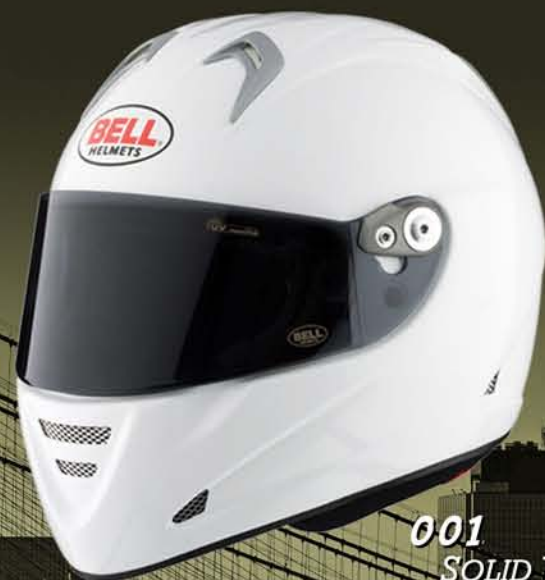
001 SOLID WHITE