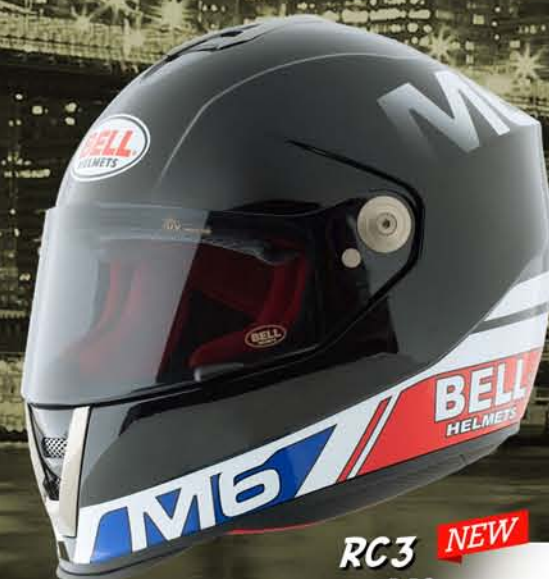
RC3 NEW M6

*SOLID COLORS additional visor & bag not included