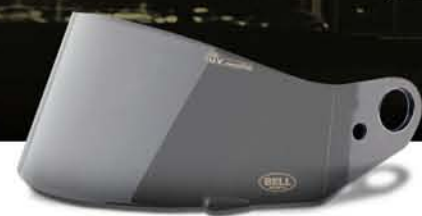
2 Visors Included * * excepting UK