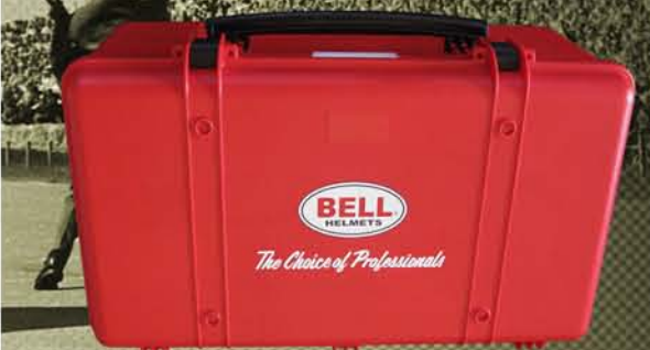
PBL 2011 GR ...AND RED