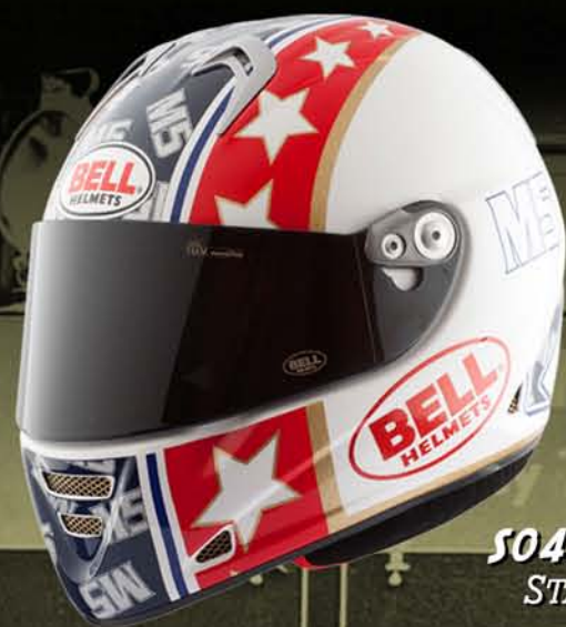
S04 NEW STAR