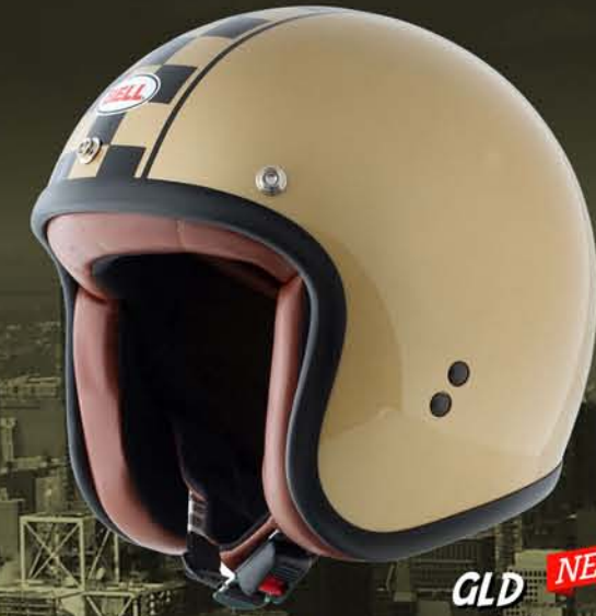
GLD RT NEW