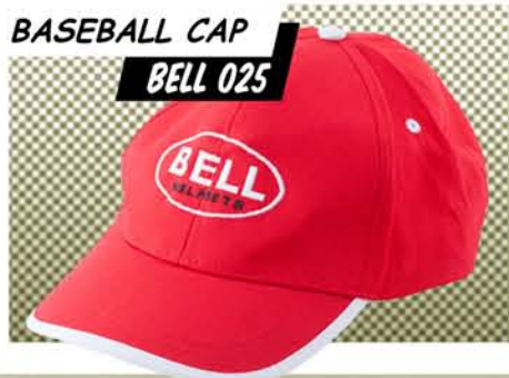
BELL 025 BASEBALL CAP