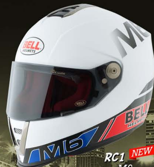
RC1 NEW M6