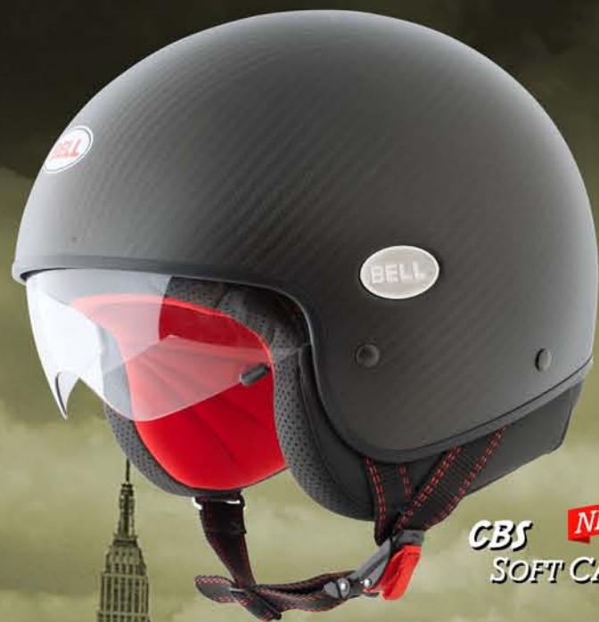
CBS NEW SOFT CARBON