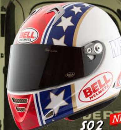
S02 NEW STAR