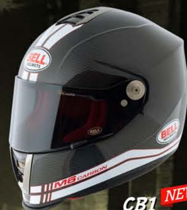
CB1 NEW CARBON