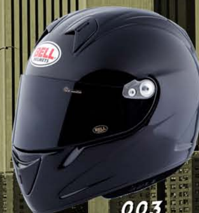
003 SOLID BLACK

SHELL MULTIAXIAL CARBON ARAMIDIC FIBRES 2 SHELLS VISOR PROFESSIONAL 3,2MM VISOR NoFOG/NoDROP INTERIOR REMOVABLE WASHABLE INTERIOR • DOUBLE D-RING SYSTEM