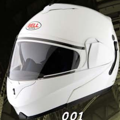
001 SOLID WHITE