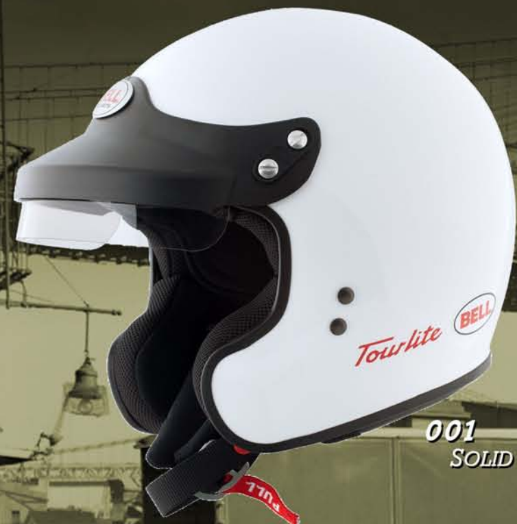
001 SOLID WHITE