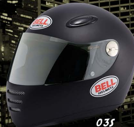
03S MATT BLACK