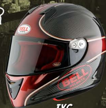
IYC INDY CARBON