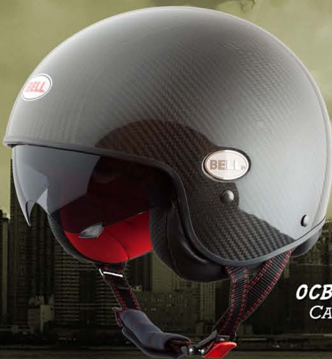
OCB NEW CARBON