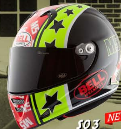
S03 NEW STAR