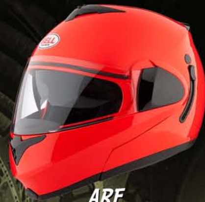
ARF SOLID ORANGE