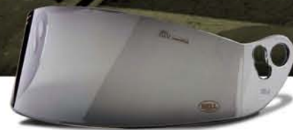
2 Visors Included ** ** excepting UK

SHELL MULTIAXIAL CARBON ARAMIDIC FIBRES 2 SHELLS VISOR PROFESSIONAL 3,2MM VISOR NoFOG/NoDROP+SMOKE 30 ADDITIONAL VISOR INTERIOR REMOVABLE WASHABLE INTERIOR • DOUBLE D-RING SYSTEM